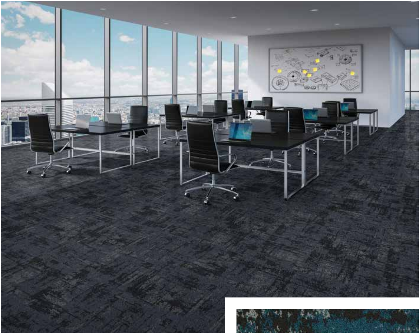
The Forces Collection: Earth Rock | Plymouth Rock